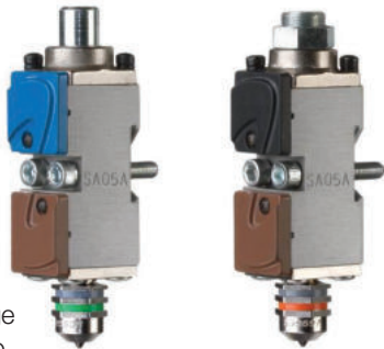
Click on image to view video

Color-coded plastic module covers provide easy identification of AO/AC (blue) or AO/SC (black) characteristics; brown color indicates needleseat design.