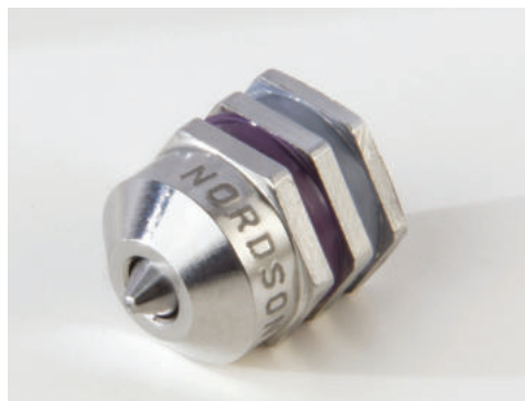
Removable, reduced cavity nozzle allows fast bead size changes without removing the module

Color-coded plastic module covers provide easy identification of AO/AC (blue) or AO/SC (black) characteristics; brown color indicates needleseat design.